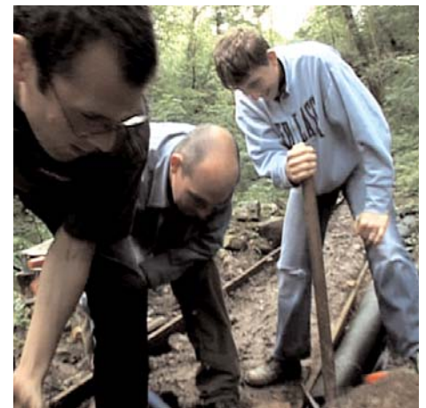
This Annual Review covers the work of Media Trust from 1 April 2005 to 31 March 2006