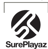
SurePlayaz Music Label Identity