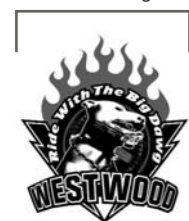
Westwood Merchandise Logo