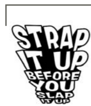
Safe Sex Slogan Club Tour Promotion